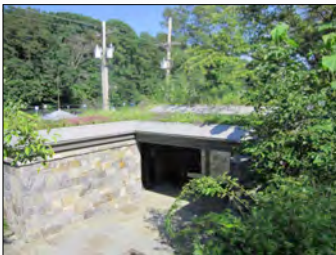
Village of Cold Spring Special Board for a Comprehensive Plan/Local Waterfront Revitalization Plan September 17, 2011