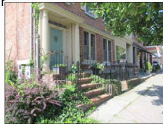
Village of Cold Spring Special Board for a Comprehensive Plan/Local Waterfront Revitalization Plan September 17, 2011