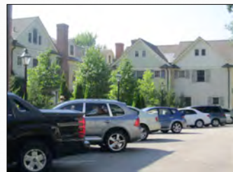
Village of Cold Spring Special Board for a Comprehensive Plan/Local Waterfront Revitalization Plan September 17, 2011