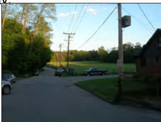
Village of Cold Spring Special Board for a Comprehensive Plan/Local Waterfront Revitalization Plan September 17, 2011