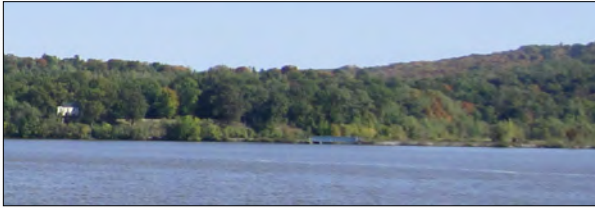
Village of Cold Spring Special Board for a Comprehensive Plan/Local Waterfront Revitalization Plan September 17, 2011